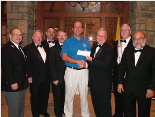
Grove City Special Olympics check presentation