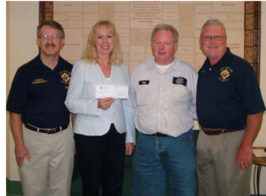
Heinzerling Foundation check presentation