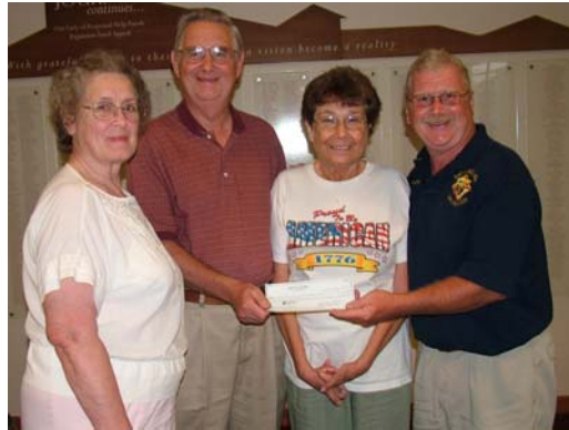
St. Vincent DePaul Golf check presentation