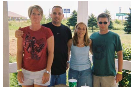
Some of the Neider clans